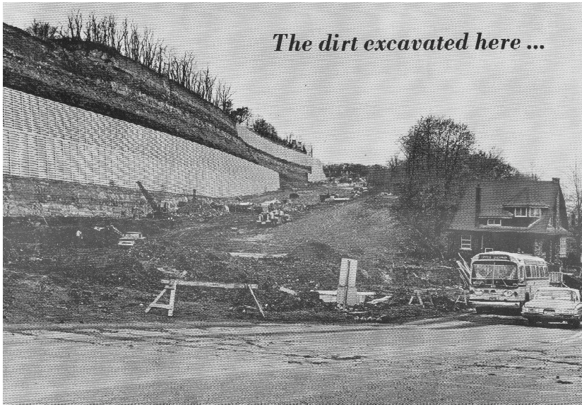
Figure 5. Ti Estin—Moving Earth: A Critical View