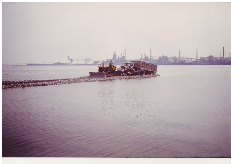
Infilling Pier 12-3 stage 1a, 1978.

cult to see in some reproductions, the photograph also captures the Burlington Skyway bridge portion of the Queen Elizabeth Way, passing over the strip of land known as the beach strip, which separated the bay from Lake Ontario.