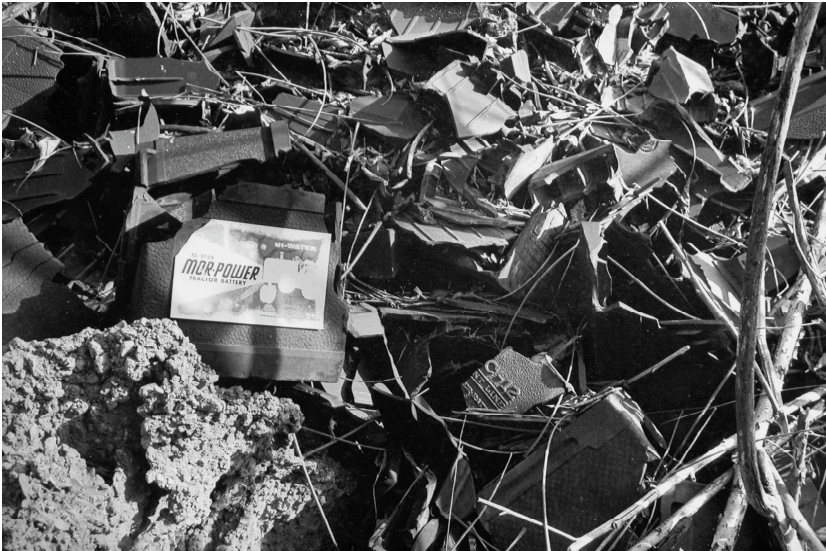
Figure 8. Clean Fill?

From 'Trespassing - More Power Anyone?' Exhibit (1992). Photograph #27.