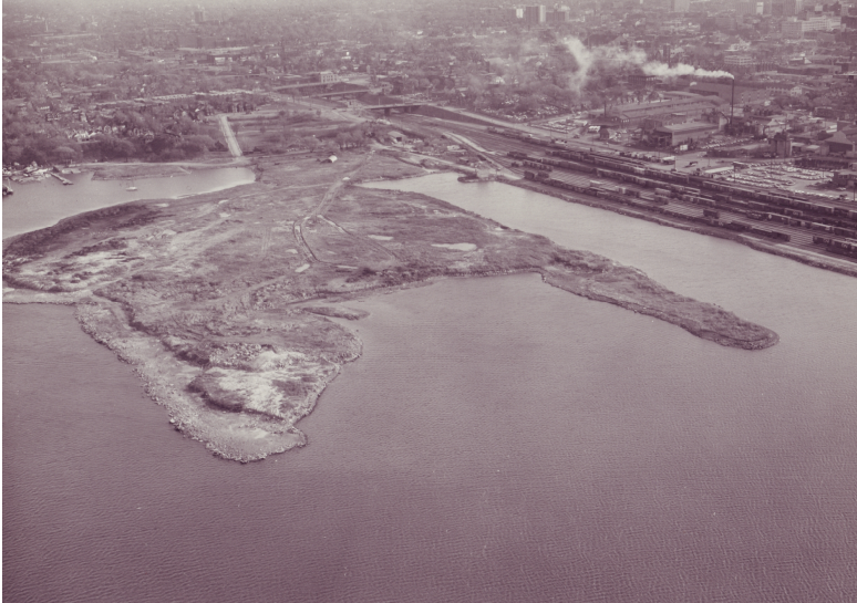
Figure 3. Making Water Lots Productive

November 1973 (5539-5).