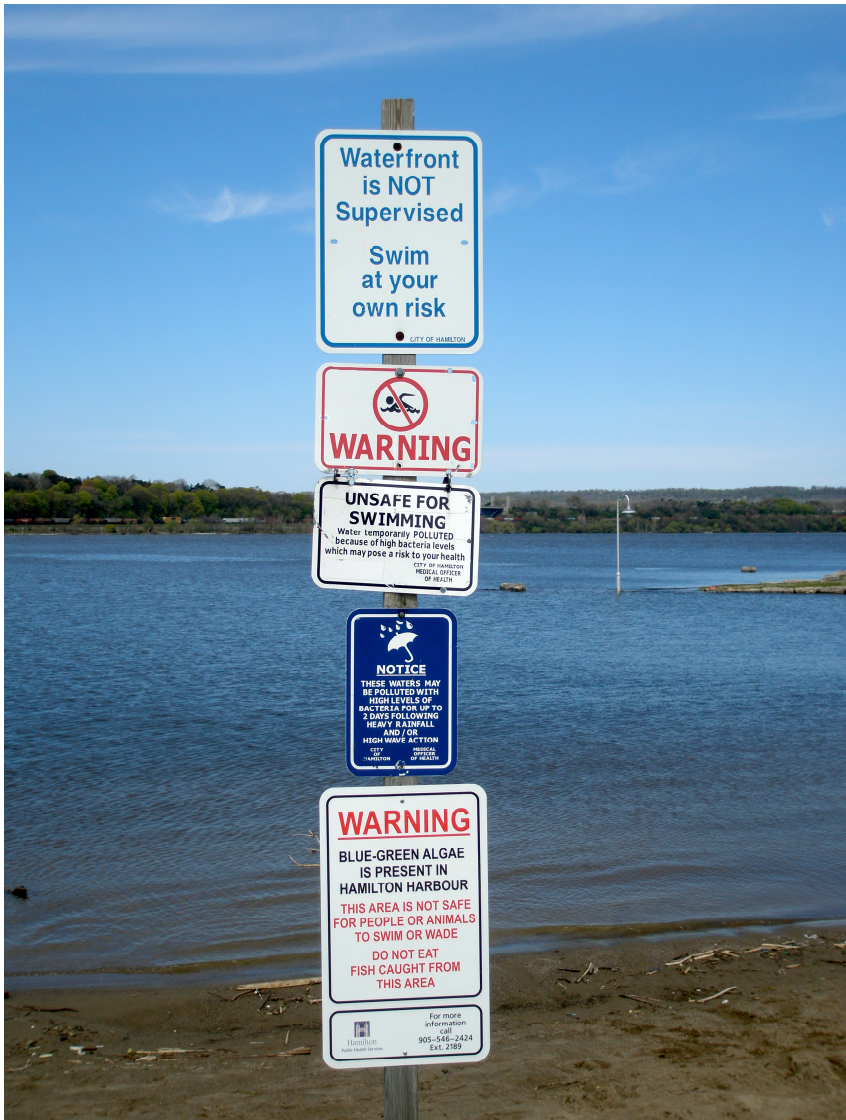
Figure 15. Reality Check: Swimming at Bayfront Park Beach