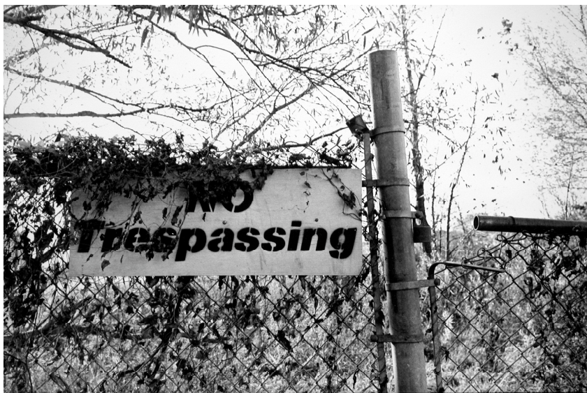
From ‘Trespassing - More Power Anyone?’ Exhibit (1992). Photograph #1.

protests, events, community meetings, and public lectures, student and citizen activists effectively brought Hamilton’s environmental problem to the attention of a wider public. 31 And what happened to the Lax Lands? For an answer, we can turn to the photographic vision of a late-twentieth-century artist activist.