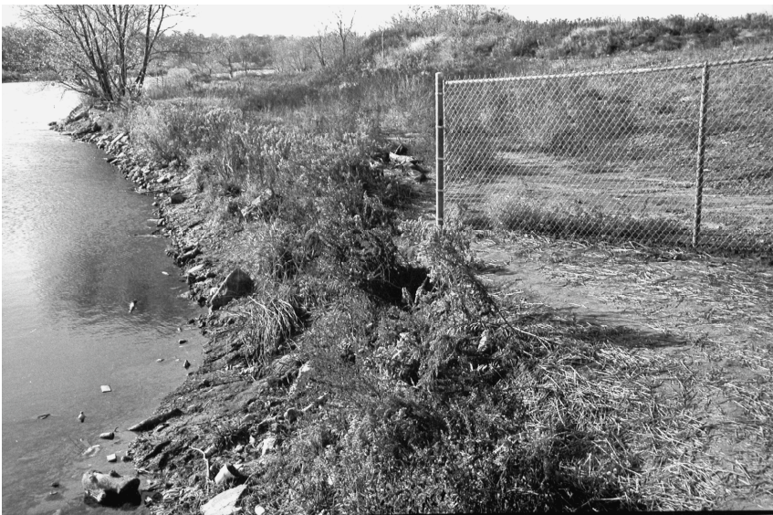
Figure 9. Nature and Regeneration

From 'Trespassing - More Power Anyone?' Exhibit (1992). Photograph # 2.