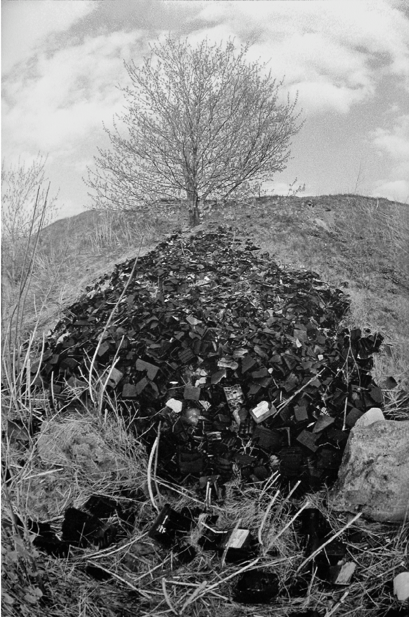
From 'The Maple Tree versus Battery Cases.' Trespassing - More Power Anyone? Exhibit (1992). Photograph #28.