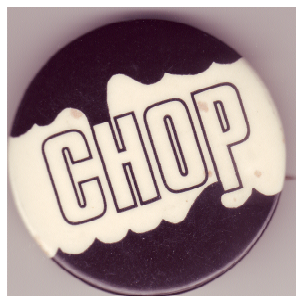
Figure 6. Citizens Speak Out: Clear Hamilton of Pollution [CHOP]