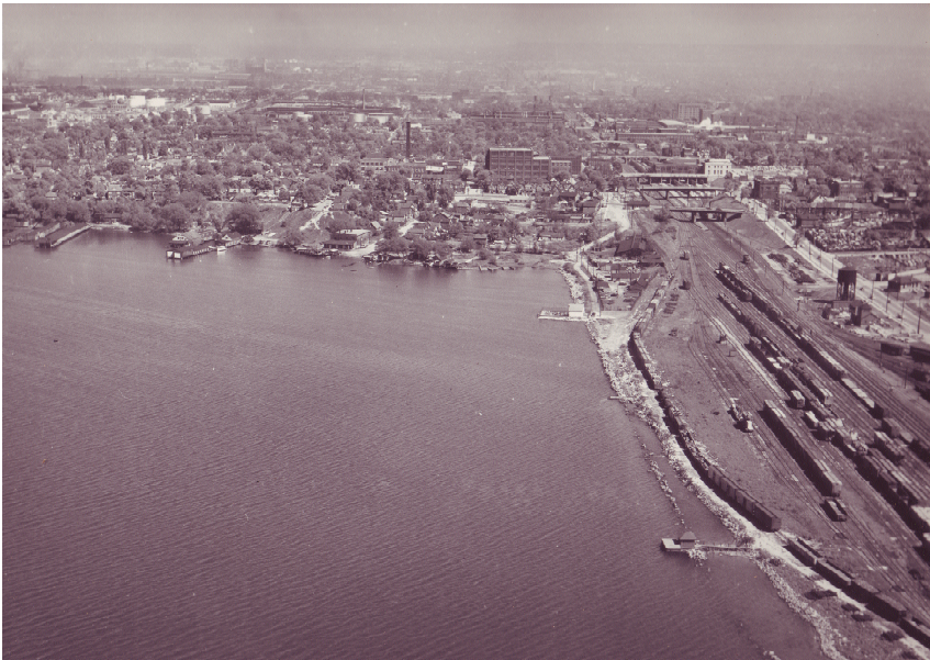
Figure 2. Wasted Water Lots in the West Harbour, 1957