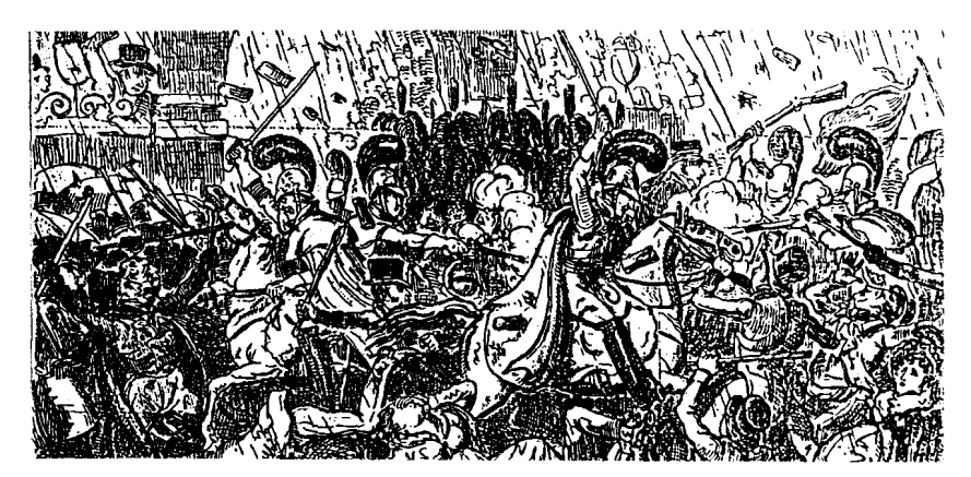
Figure 5: Crowds diverting the funeral procession of Queen Caroline, 14 August 1821.

The impressive discipline of the London trades was equally evident at the Queen's procession to St. Paul's in late November, when they acted as unofficial constables for the official cavalcade, "locked arm-in-arm," and then brought up the rear with a great variety of flags.<sup>78</sup> But it was most evident at the funeral procession of the Queen twenty months later. Long before then the Queen's cause was in tatters, the victim of Parliamentary intransigence, Whig diffidence, and of her own willingness to accept a pension of £50,000 a year. Even so, the London trades were determined to have the last word. When it was learned that the government intended to take her body around rather than through London on its way to Harwich, London crowds blocked the procession route and forced the cortège to pass through the city despite the efforts of the Life Guards to prevent it. (Figure 5) Here the London trades, with their banners,