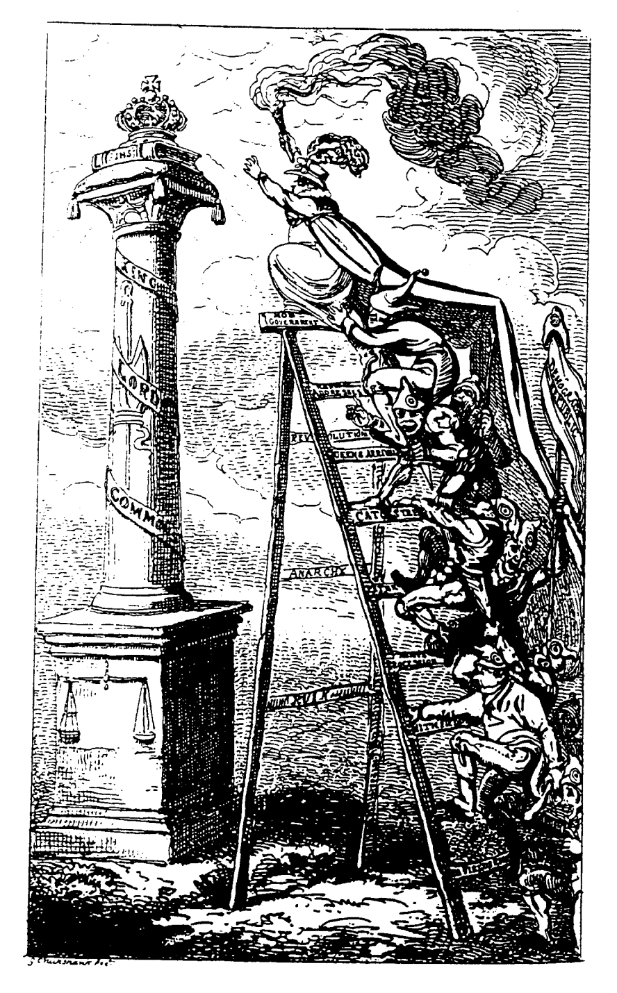
Figure 4: The Radical Ladder.