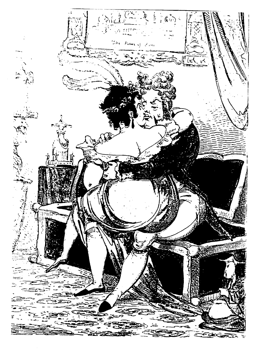
Figure 1: George IV at Brighton, with mistress and brandy bottle .