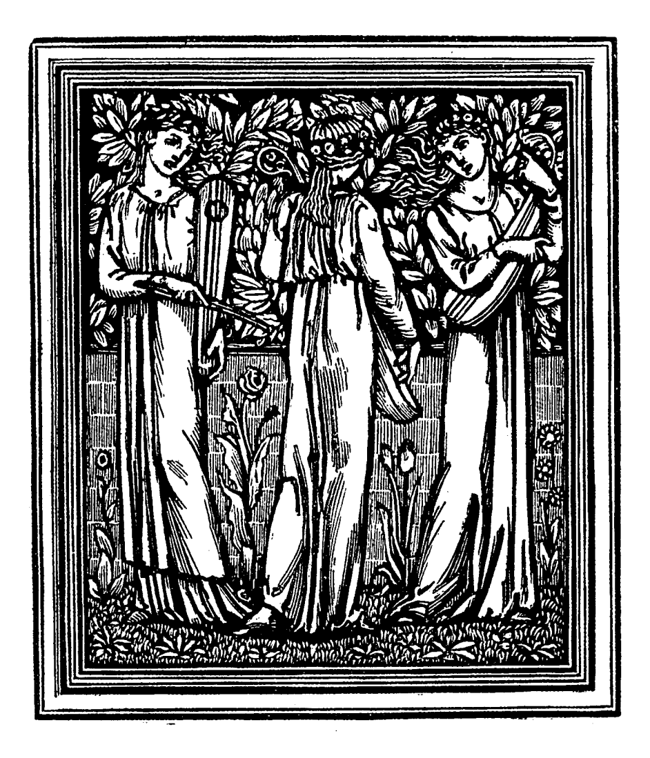
WILLIAM MORRIS, Three Female Musicians from The Earthly Paradise.