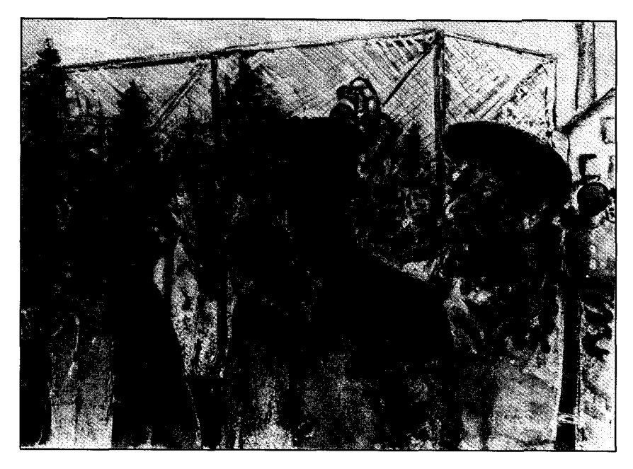
Get His F-ing cap — 22" x 36" — w/c: pastel on paper — 1985

They were still elbow to elbow even though their nervousness was receding. McNulty stopped abruptly and Johnny collided with him.