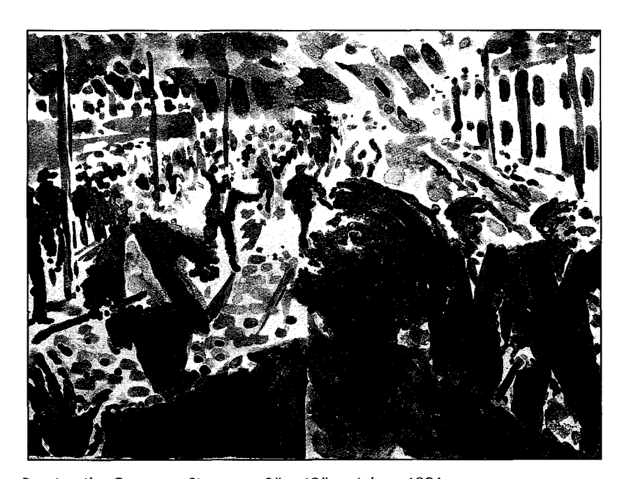
Burning the Company Stores — 9" x 12" — ink — 1981

Joe went in that direction after a moment, walking quickly along the street the police had charged down. He quickened his pace as he neared the alley where Carmichael died but stopped helplessly as he came directly opposite the place and shuddered violently before hurrying on, having noticed only that the pony cart was gone and a stain, which really could have been anything, showed black against the green, weathered shingles.