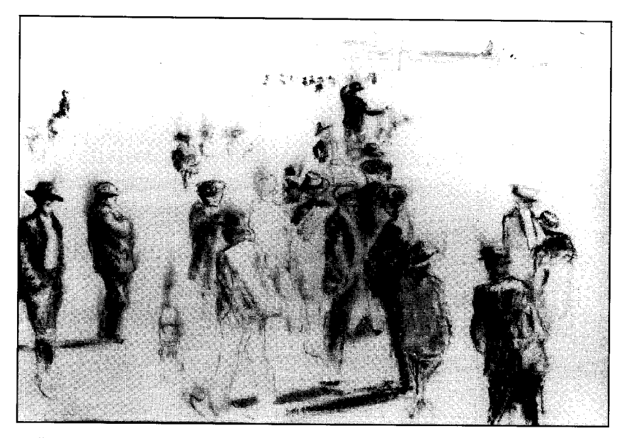
Rally — 29" x 40" — w/c: matches on canvas — 1985