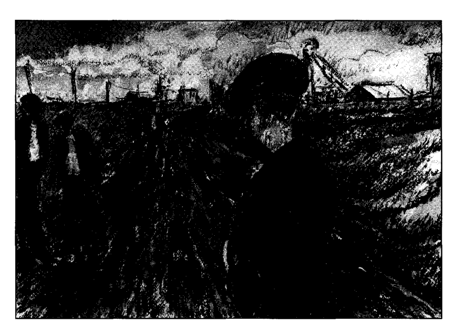
Idle — 15" x 22" — w/c: pastel on paper — 1983

When he'd put the stone aside and covered the broken useless gun he heard the noise again carried from the street by the wind and he looked about quickly for a heavy stick which he swung overhead as he ran down to join the fight.