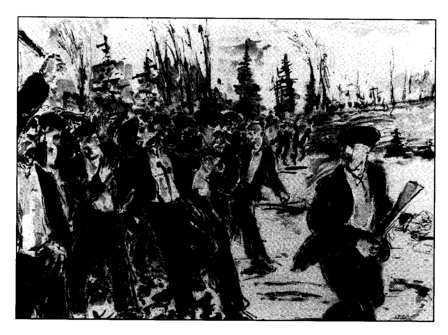
Waterford Lake — 22" x 33" — w/c: pastel on paper — 1984