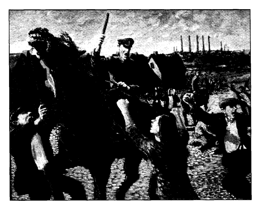
July 1/1923, Bloody Sunday — 18" x 24" — acrylic

—He's right Jim. The rumour is too that they'll read the riot act. We won't be able to meet...no more than two or three at a time. —