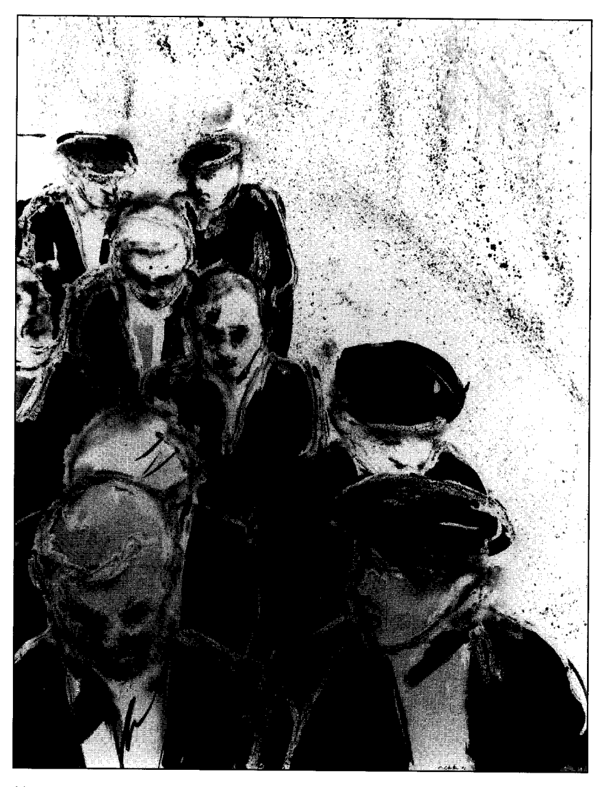
Line Up — 24" x 18" — w/c: matches on paper — 1981