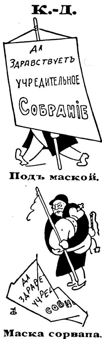
Figure 2: The Kadet Party “Masked” and “Unmasked.” The banner reads, “Long Live the Constituent Assembly.” Pravda , 13 Dec. 1917. In January 1918, the Constituent Assembly met for the first time, and was quickly prorogued by the Bolsheviks.